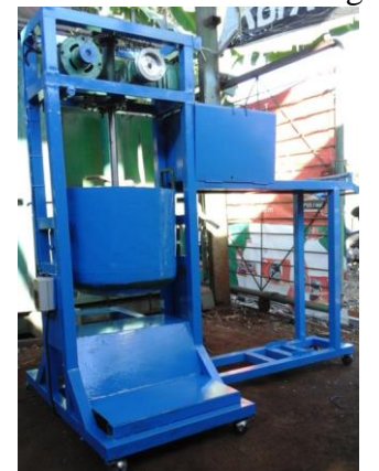
Figure 2. Dodol mixer machine design.

From Table 3, it can be seen from the assessment that the concept variant with the highest value is the concept variant that will be selected to be used as the design for the machine to be made.