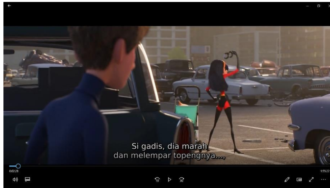
Picture 2. Tony met Violet Parr

Tony: [o.s.] I sort of knew her, but she'd changed. Relaxed. She was more sure of herself. Cool, cute. I asked her out to a movie. (00;56-01;56 )